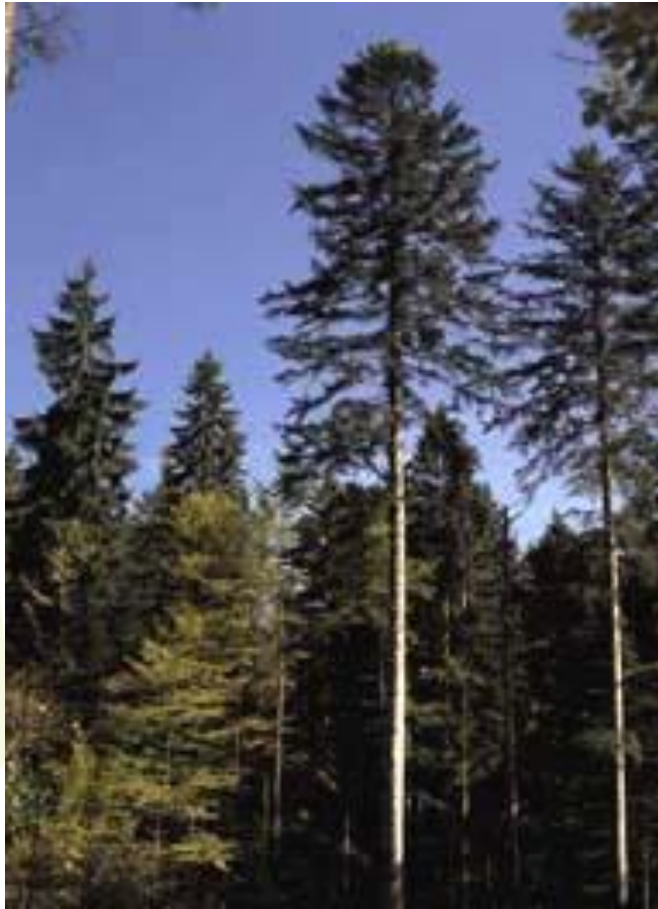
proven by Nature