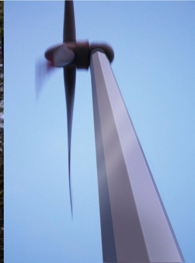
strong by design