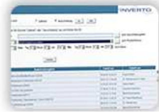
● INVERTO AG E-CONTOR