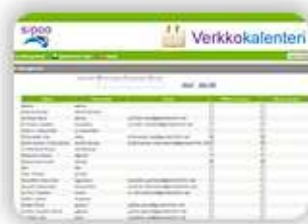
● SIPOO APPOINTMENT CALENDAR