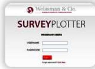
● WEISSMAN & CIE SURVEY PLOTTER